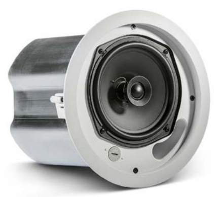
Included grille not shown